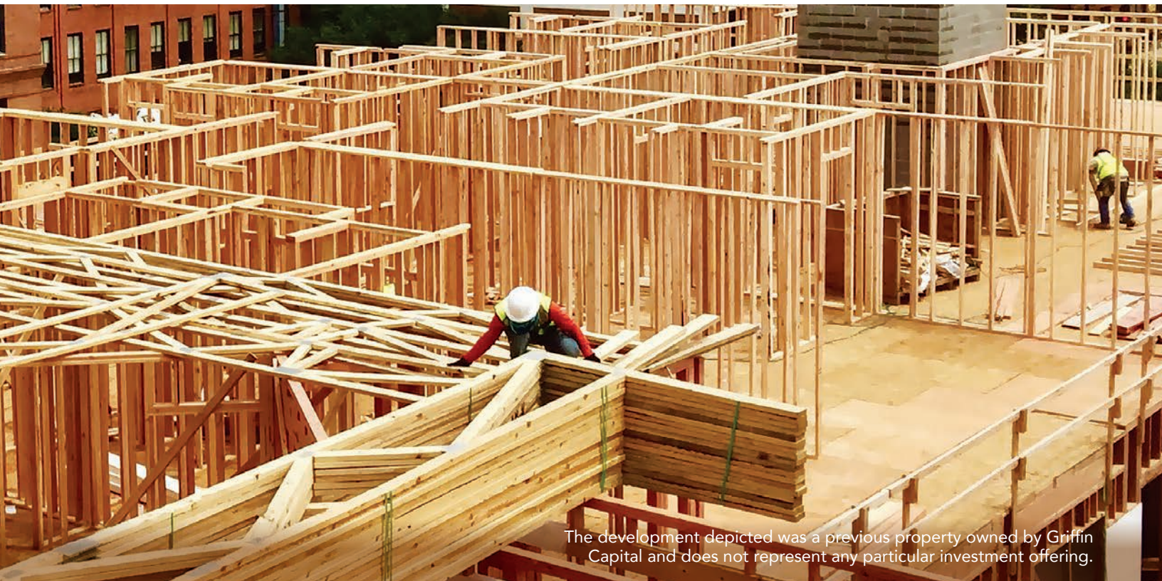
The development depicted was a previous property owned by Griffin Capital and does not represent any particular investment offering.